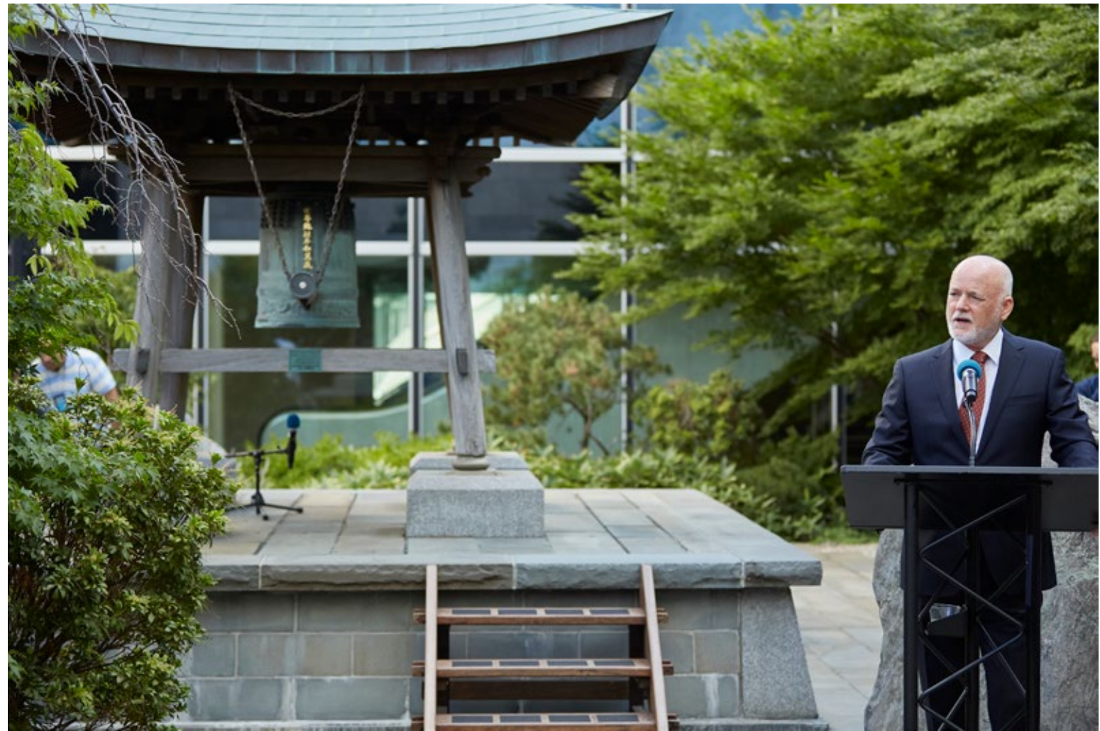
Secretary-General Ban Ki-moon rings the Peace Bell at the annual ceremony held at UN headquarters in observance of the International Day of Peace, Seventy-First Session General Assembly President Thomson, 21 September 2016 as Messengers of Peace look on.