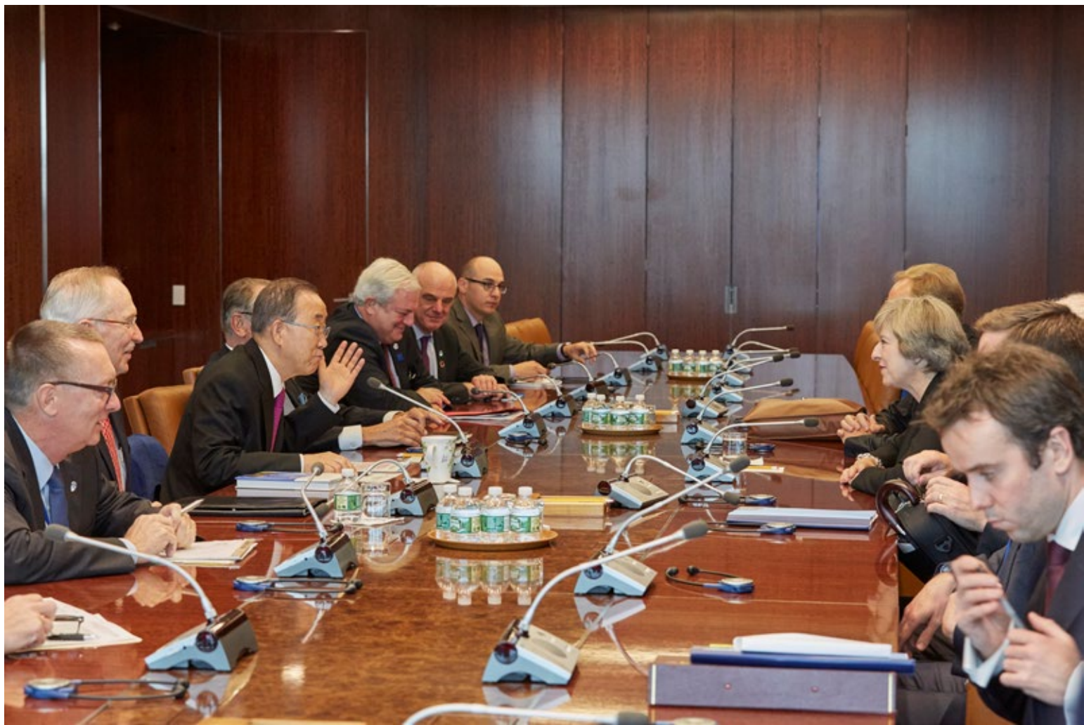
UN HEADQUARTERS, NEW YORK, UNITED STATES: The Secretary-General with H.E. Mrs, Theresa May, MP, Prime Minister, United Kingdom of Great Britain and Northern Ireland., September 19,2016