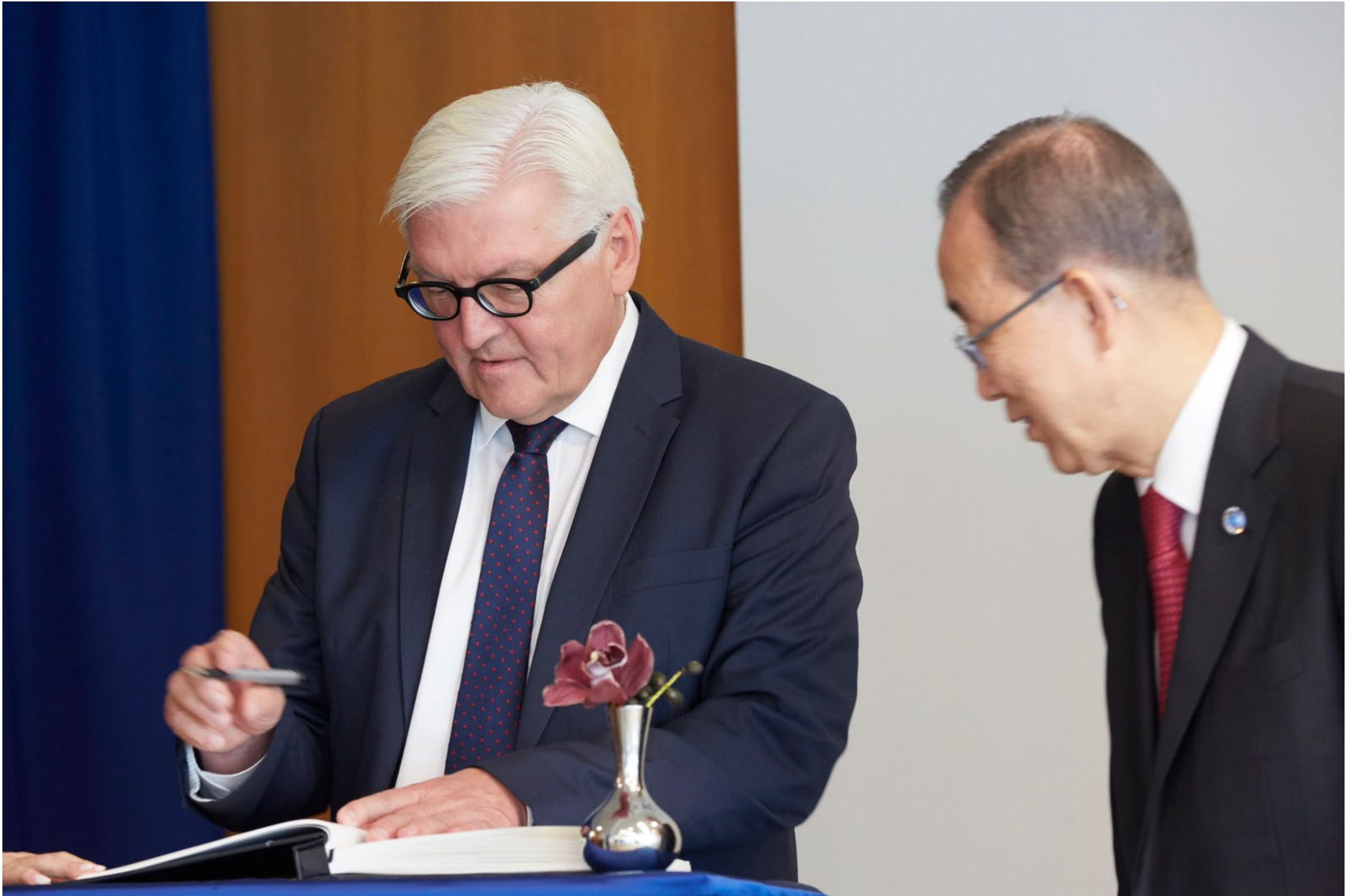
US: United Nations Headquarters, New York, 21 September, 2016, Secretary General Ban Ki-moon greets H.E. Frank-Walter Steinmeier, Foreign Minister, Federal Republic of Germany.