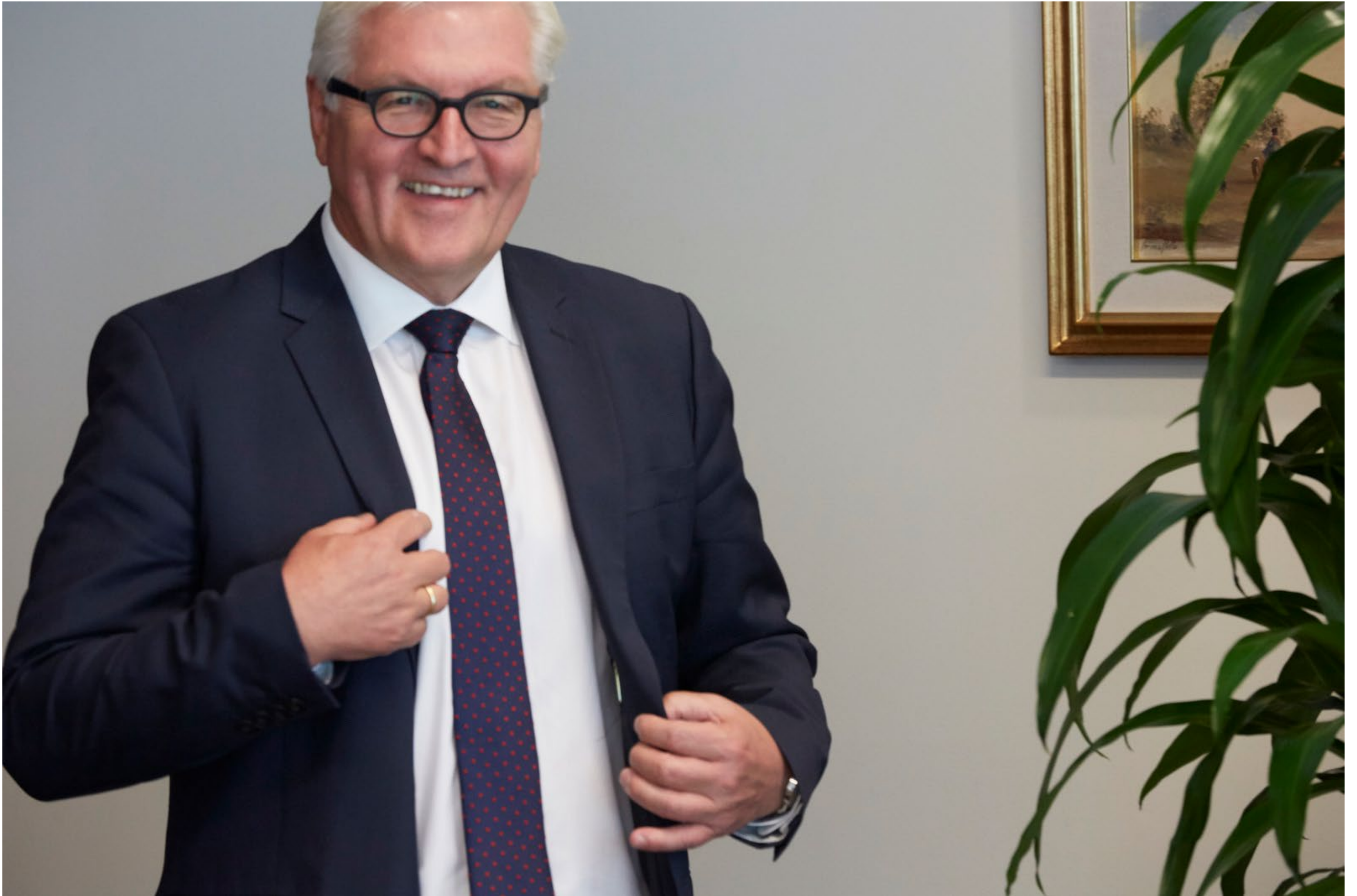
US: United Nations Headquarters, New York, 21 September, 2016, Secretary General Ban Ki-moon greets H.E. Frank-Walter Steinmeier, Foreign Minister, Federal Republic of Germany.