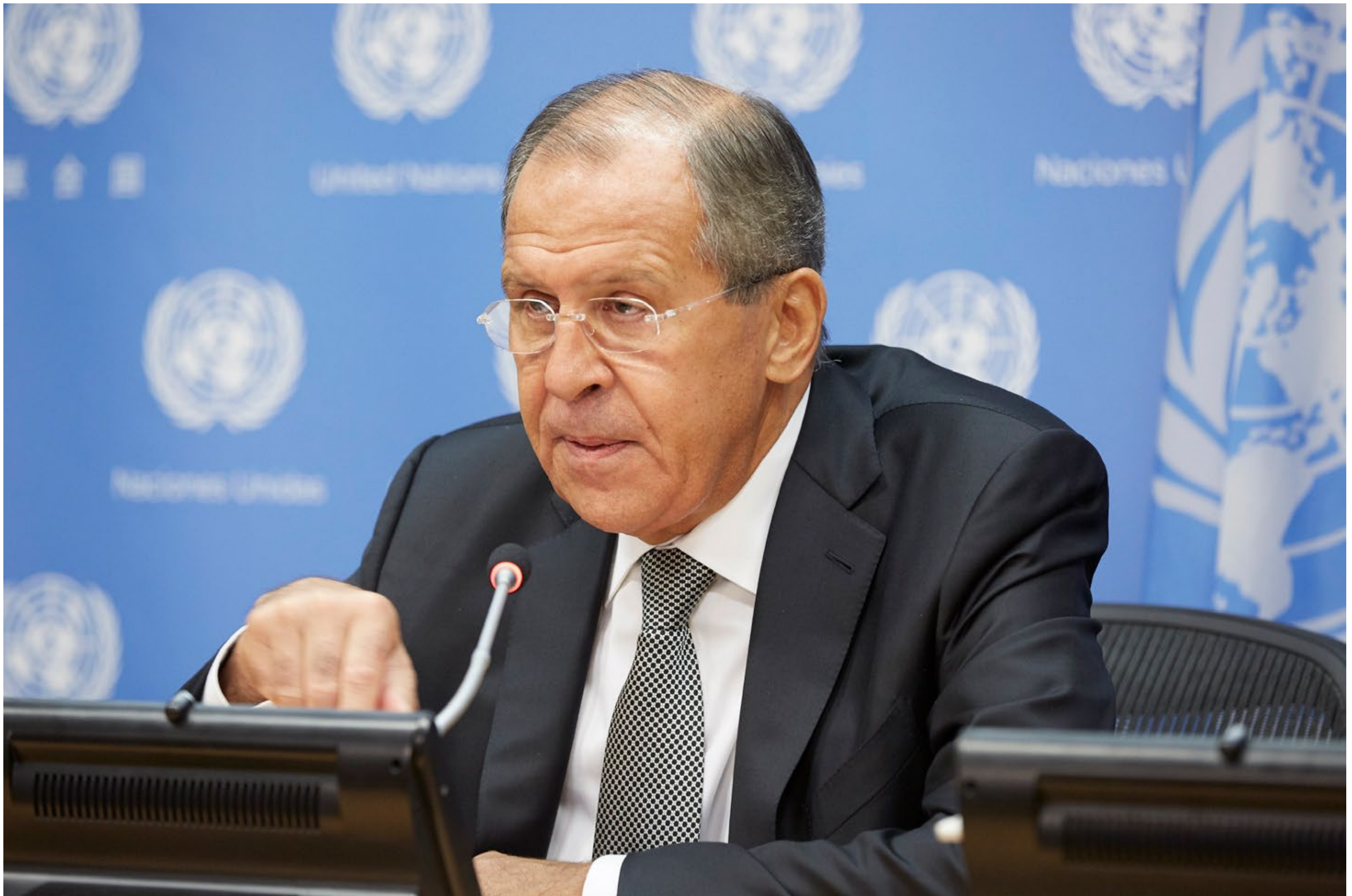
Minister for Foreign Affairs of the Russian Federation,... UN HEADQUARTERS, NEW YORK, UNITED STATES - 2016/09/23: Minister for Foreign Affairs of the Russian Federation, Sergey Lavrov, briefed the press.