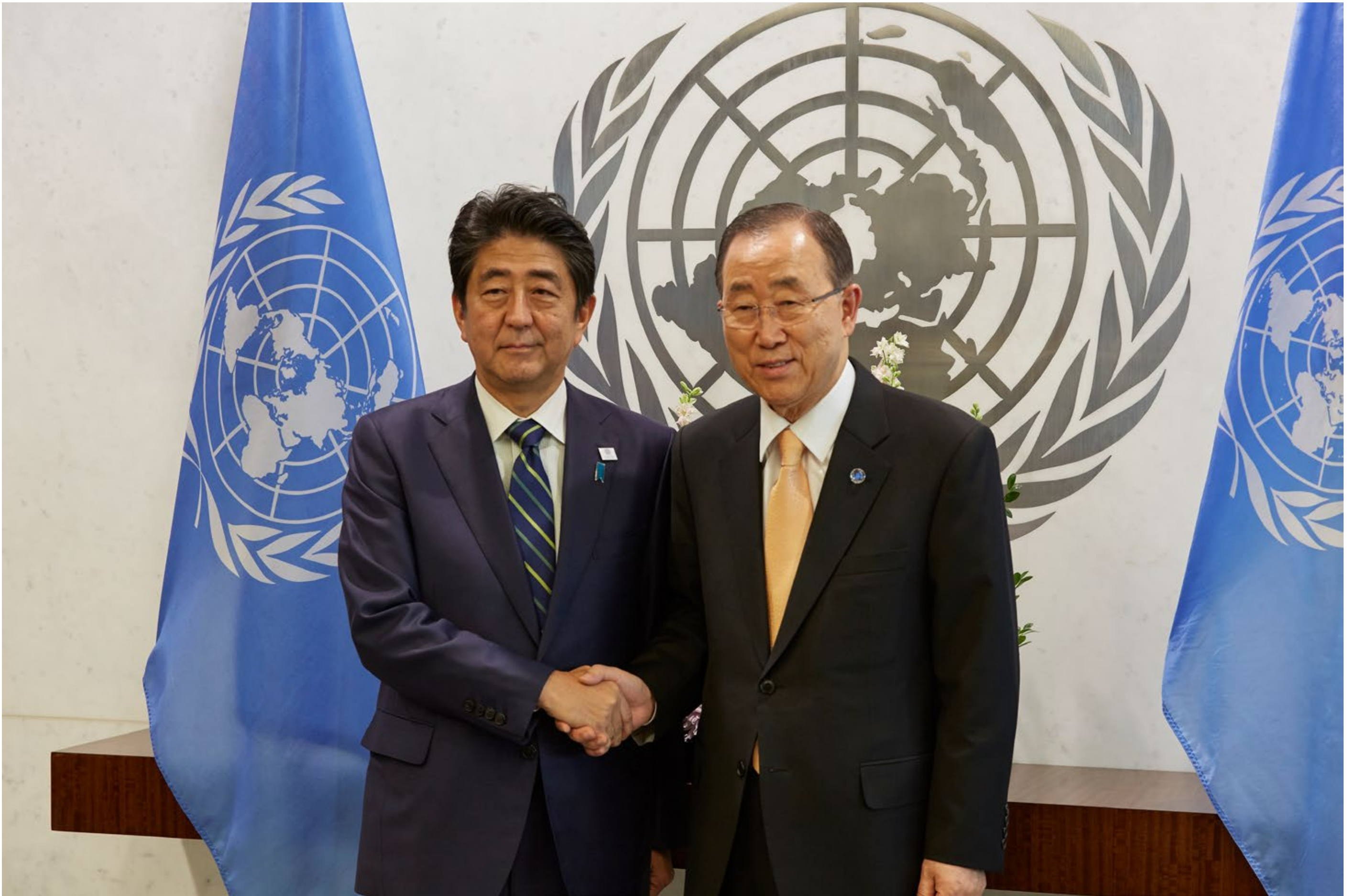
Japan's Prime Minister Shinzo Abe in bilateral talks with UN Secertary-General Ban Ki-moon, 20 September 2016