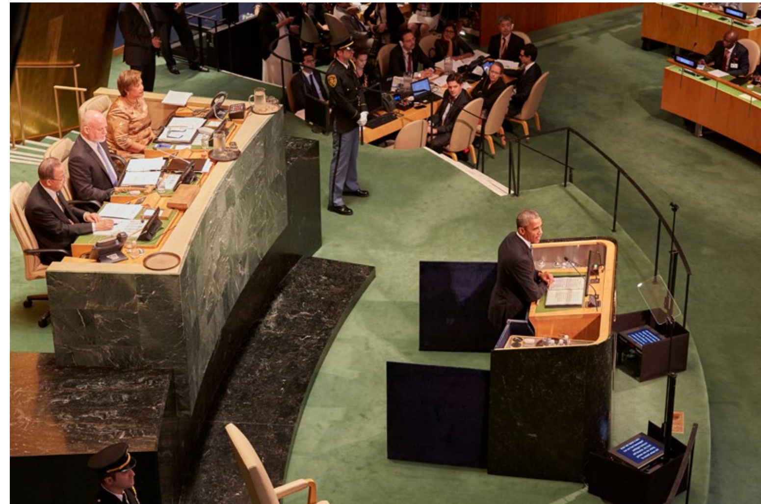
44th President of the United States, Barack Obama addresses the General Assembly's 71st session, 20 September 2016