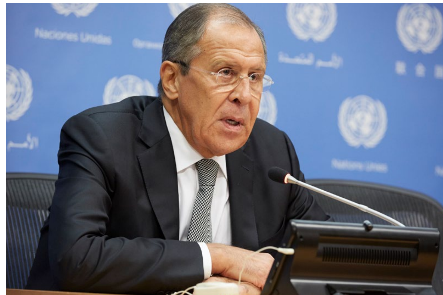
Minister for Foreign Affairs of the Russian Federation, Sergey Lavrov, briefed the press, September 23, 2016