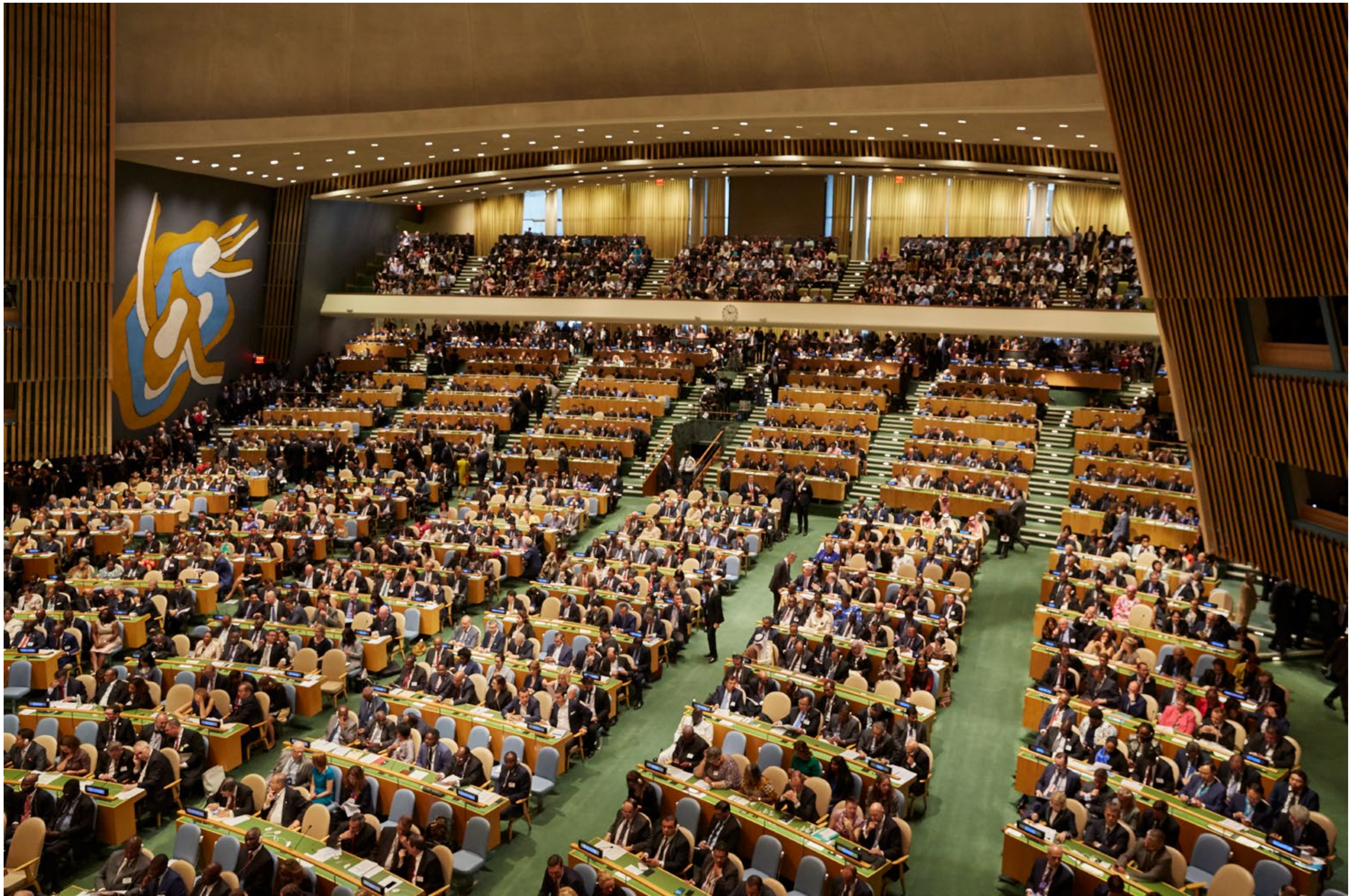
United Nations Seventy-First General Assembly 20 September 2016