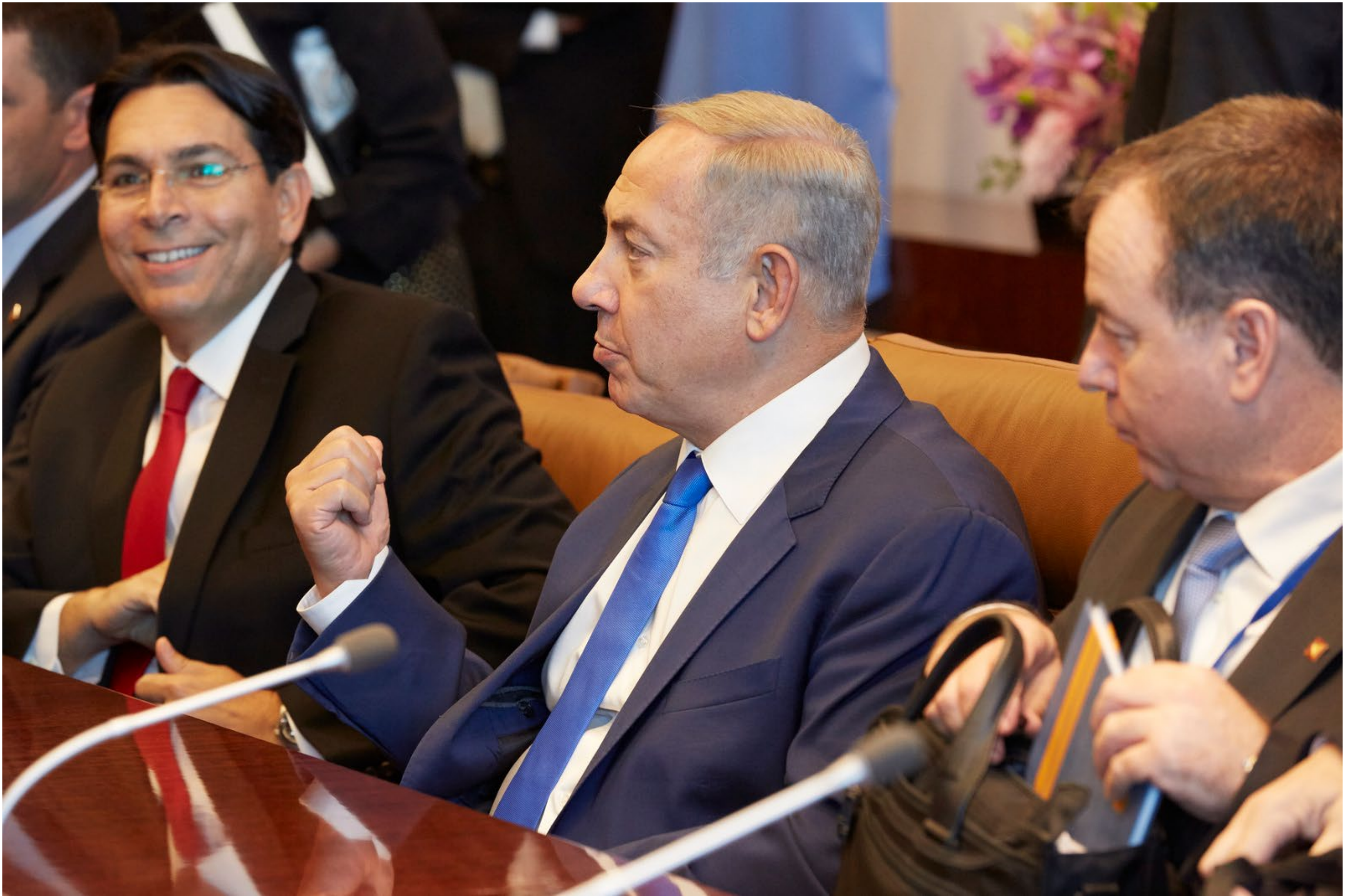
UN HEADQUARTERS, NEW YORK, UNITED STATES Secretary General Ban Ki-moon (unseen) met with H.E. Benjamin Netanyahu, Prime Minister, State of Israel today. September 22, 2016