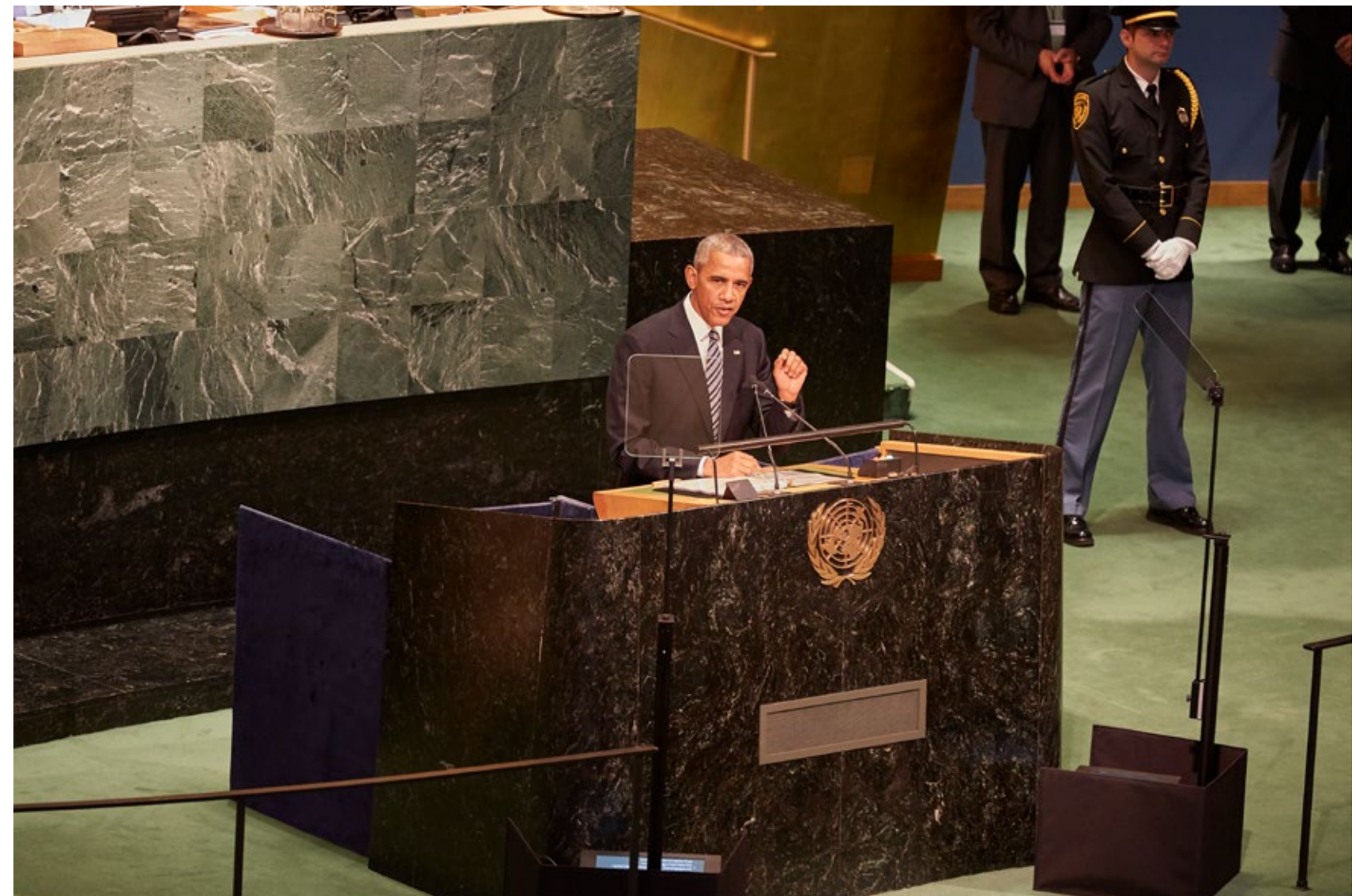
44th President of the United States, Barack Obama addresses the General Assembly's 71st session, 20 September 2016