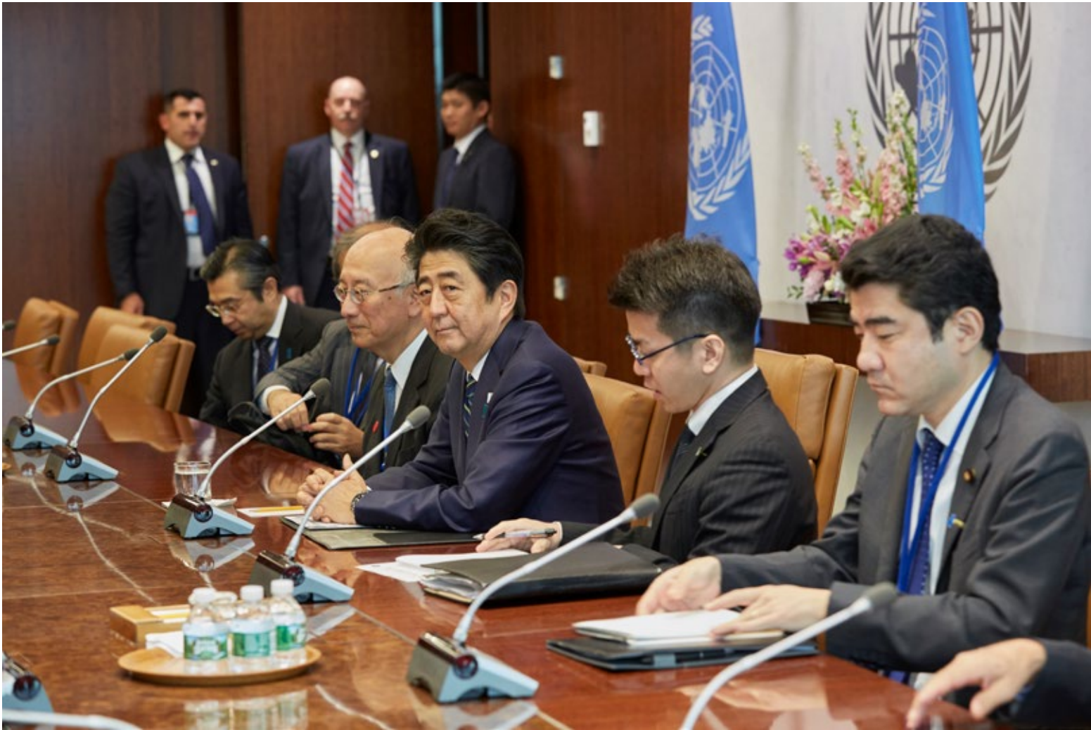
Japan's Prime Minister Shinzo Abe in bilateral talks with UN Secetary-General Ban Ki-moon, 20 September 2016