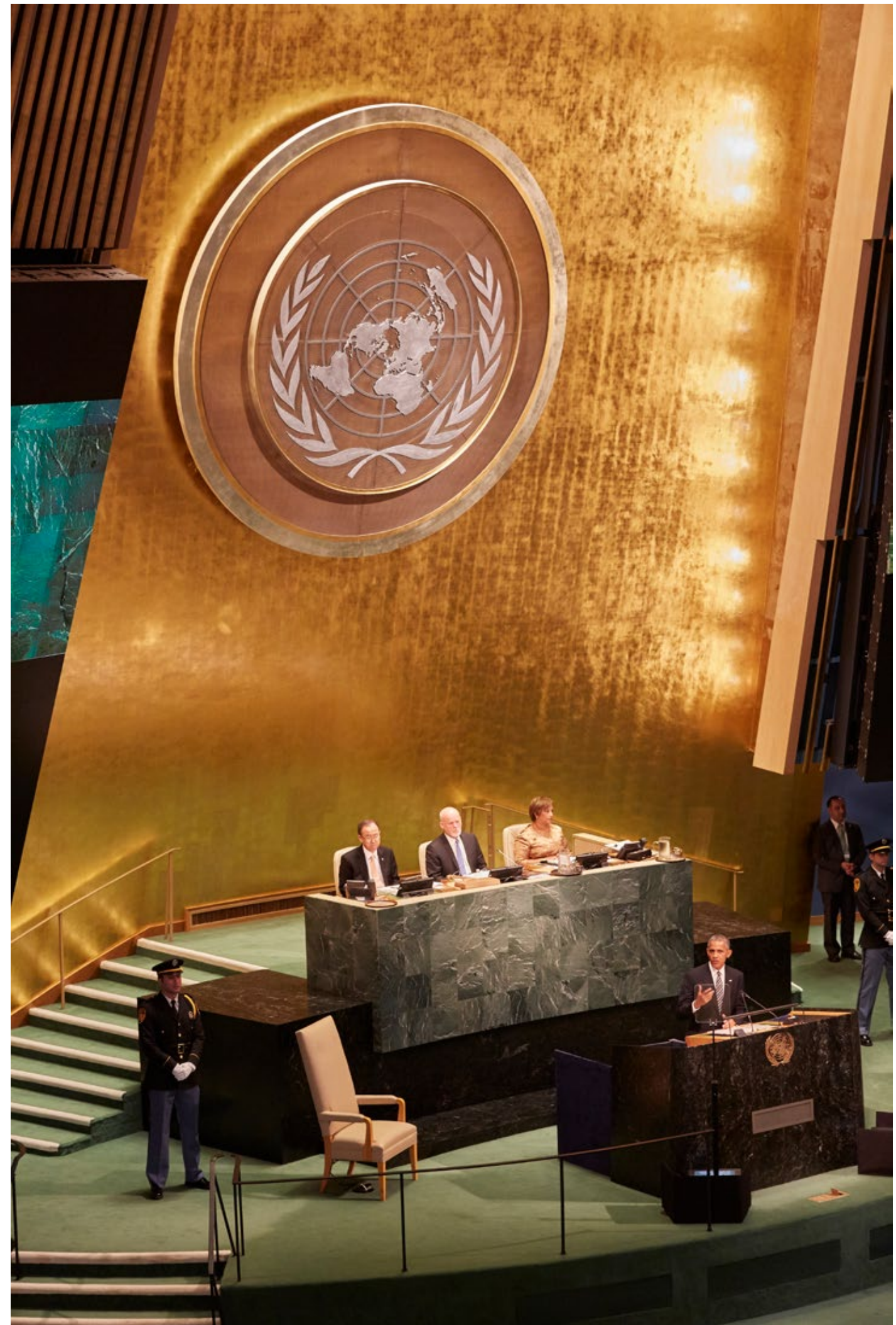
44th President of the United States, Barack Obama addresses the General Assembly's 71st session, 20 September 2016

The Charter of the United Nations was signed on 26 June 1945, in San Francisco, at the conclusion of the United Nations Conference on International Organization, and came into force on 24 October 1945. The Statute of the International Court of Justice is an integral part of the Charter. Visit the UN Dag Hammarskjöld Library's collection of translations of the UN Charter.