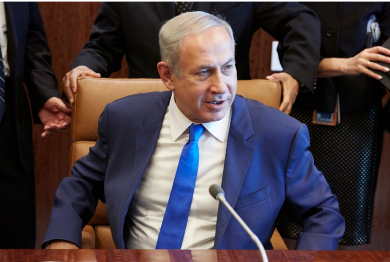
UN HEADQUARTERS, NEW YORK, UNITED STATES: Secretary General Ban Ki-moon (unseen) met with H.E. Benjamin Netanyahu, Prime Minister, State of Israel today. September 22, 2016