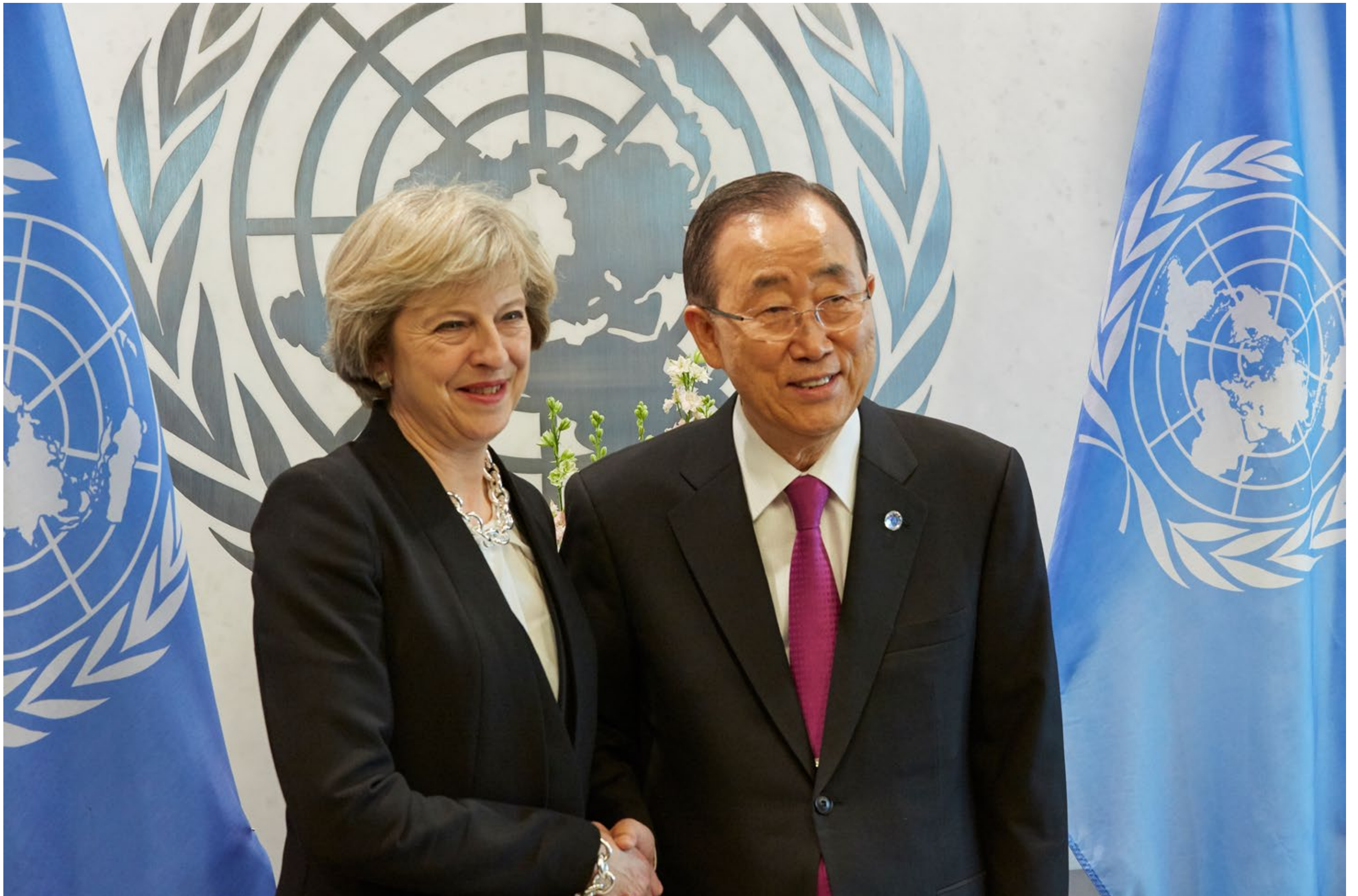
The Secretary-General with H.E. Mrs, Theresa May, MP, Prime... UN HEADQUARTERS, NEW YORK, UNITED STATES - 2016/09/19: The Secretary-General with H.E. Mrs, Theresa May, MP, Prime Minister, United Kingdom of Great Britain and Northern Ireland.