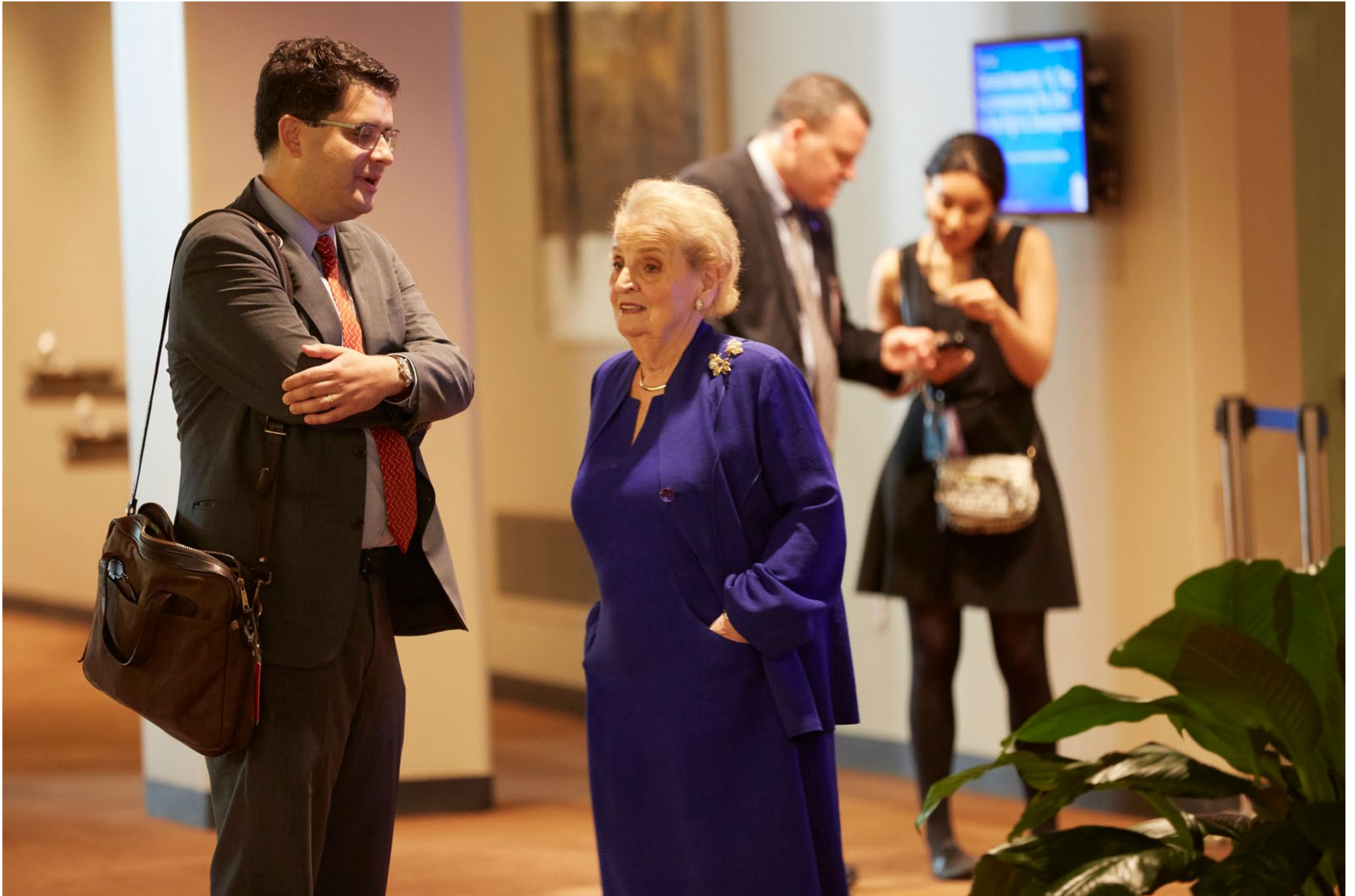
US: United Nations Headquarters, New York, 21 September, 2016, Madeleine Jana Korbel Albright is the first woman to have become the United States Secretary of State. Chatting with colleague before she spoke to the press today outside of the security council at the UN.