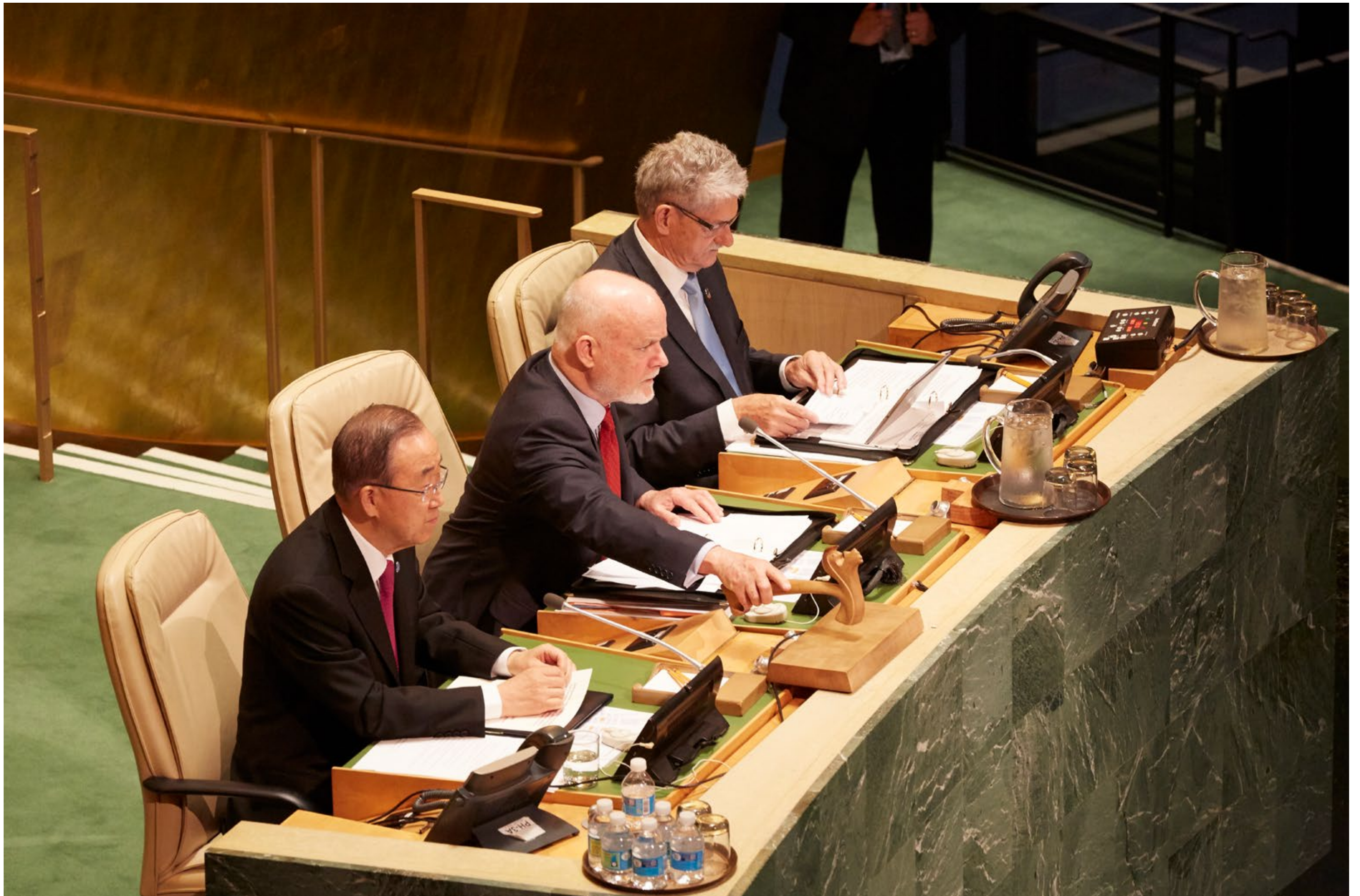
Peter Thomson, President General Assembly gavels the Seventy-First Session of the General Assembly 19 September 2016 where world leaders came together to adopt the New York Declaration for Refugees and Migrants which expresses the political will of world leaders to protect the rights of refugees and migrants, to save lives and share responsibility for large movements on a global scale.