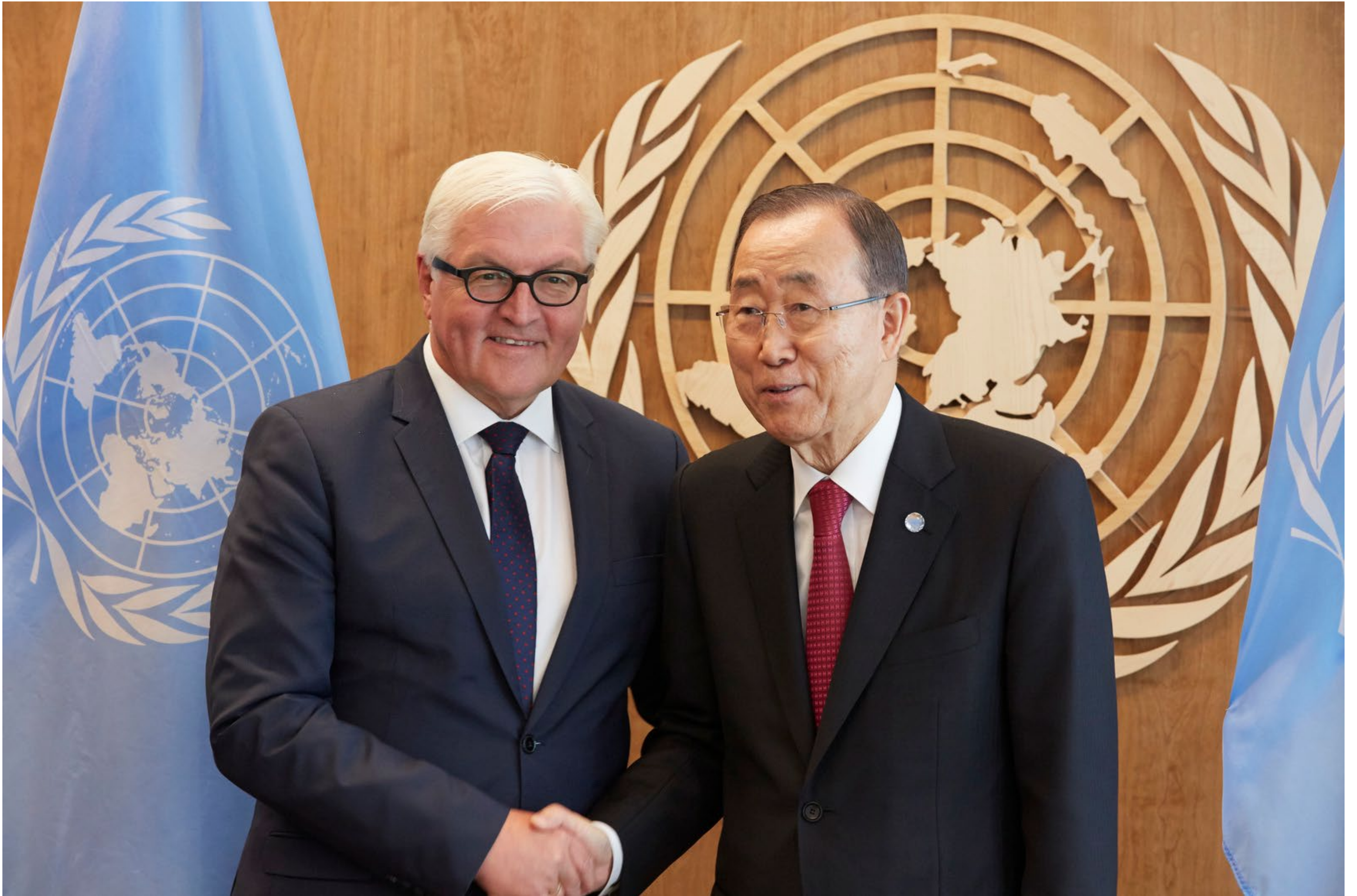
US: United Nations Headquarters, New York, 21 September, 2016, Secretary General Ban Ki-moon greets H.E. Frank-Walter Steinmeier, Foreign Minister, Federal Republic of Germany.