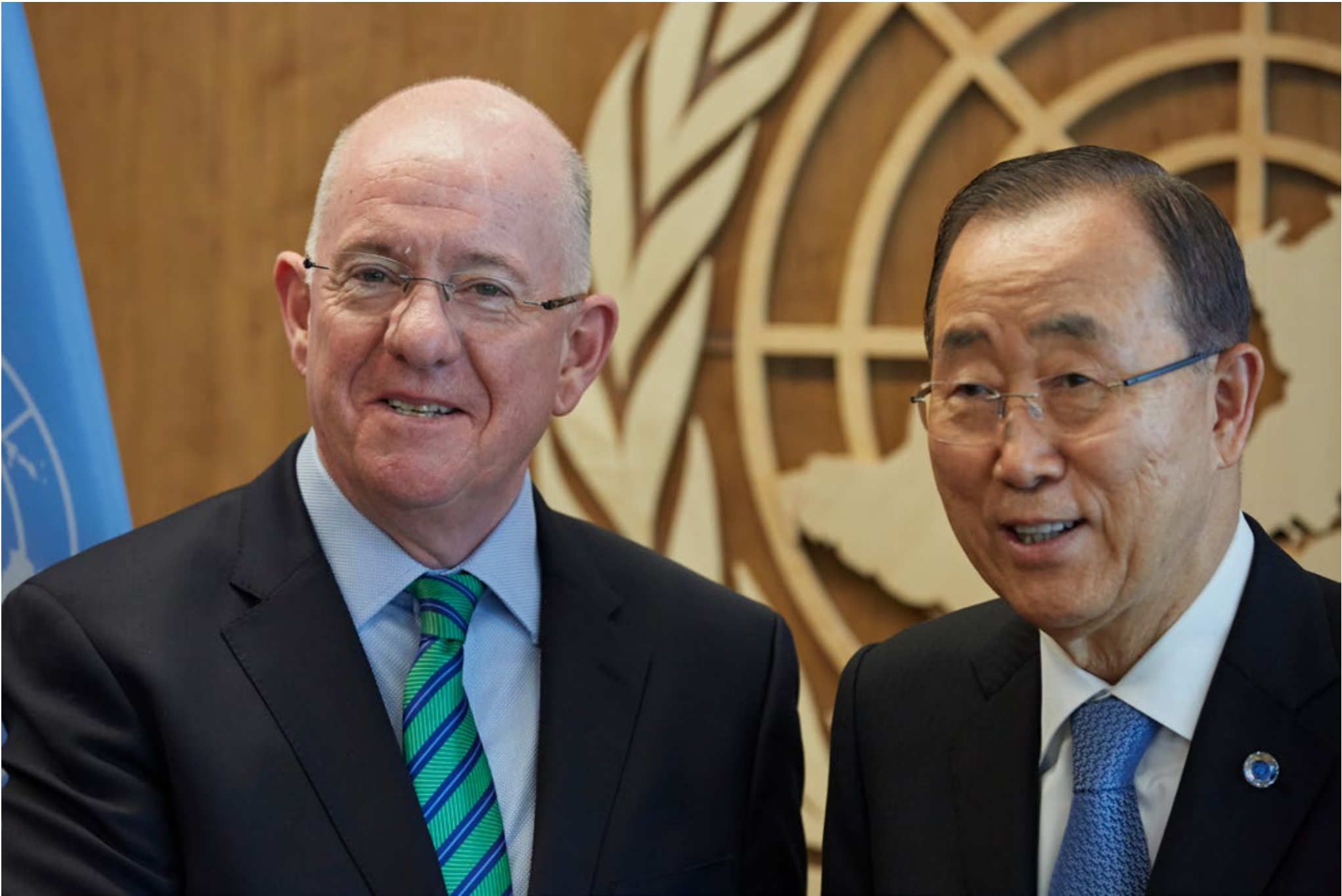
Charles Flanagan, Minister for Foreign Affairs and Trade of Ireland, meets with Secretary-General Ban ki-Moon, 24 septemebr 2016